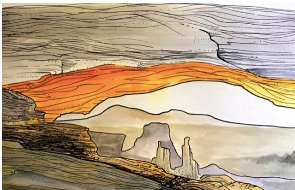
Delaney B., 'Landscape,' De Winton

Current buses have a diesel engine, however, these are responsible for using 1 gallon of fuel every 6 to 10 kilometres. In the United States, school buses alone contribute to 9 million metric tons of carbon dioxide in the atmosphere. Buses should be further modernized through using renewable energy and/or alternative fuel sources to promote a greater reduction in greenhouse gas emissions and other pollutants. Additionally, diesel fumes contribute to many problems for students which can lead to or affect asthma, lung problems, heart problems, allergies or other general medical conditions. Therefore, it is important to utilize more sustainable fuel sources to reduce health concerns.